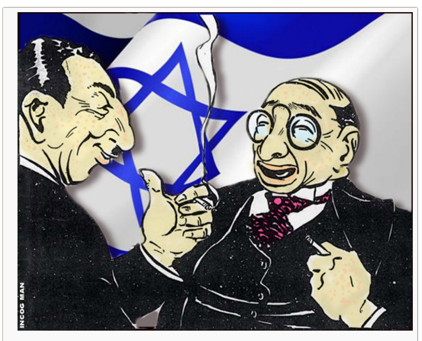
Zionism and Communism are but two arms of the Jewish World Swindle.

Jews have long been in control of the world, and continue to rule it today. This is revealed to us simply by observing the actions and words of the leaders of World Zionism and World Communism, the twin vehicles of global Jewish subversion.