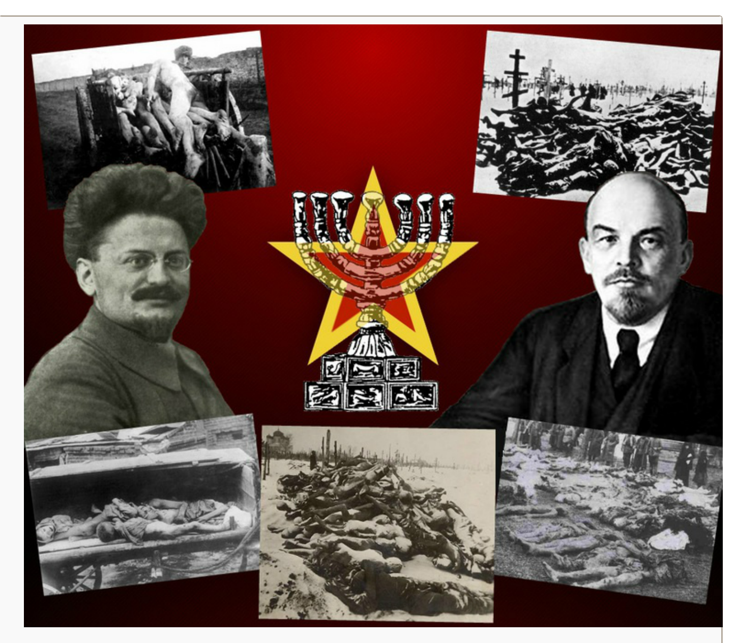
This is what awaits us in the Jewish New World Order, beware!