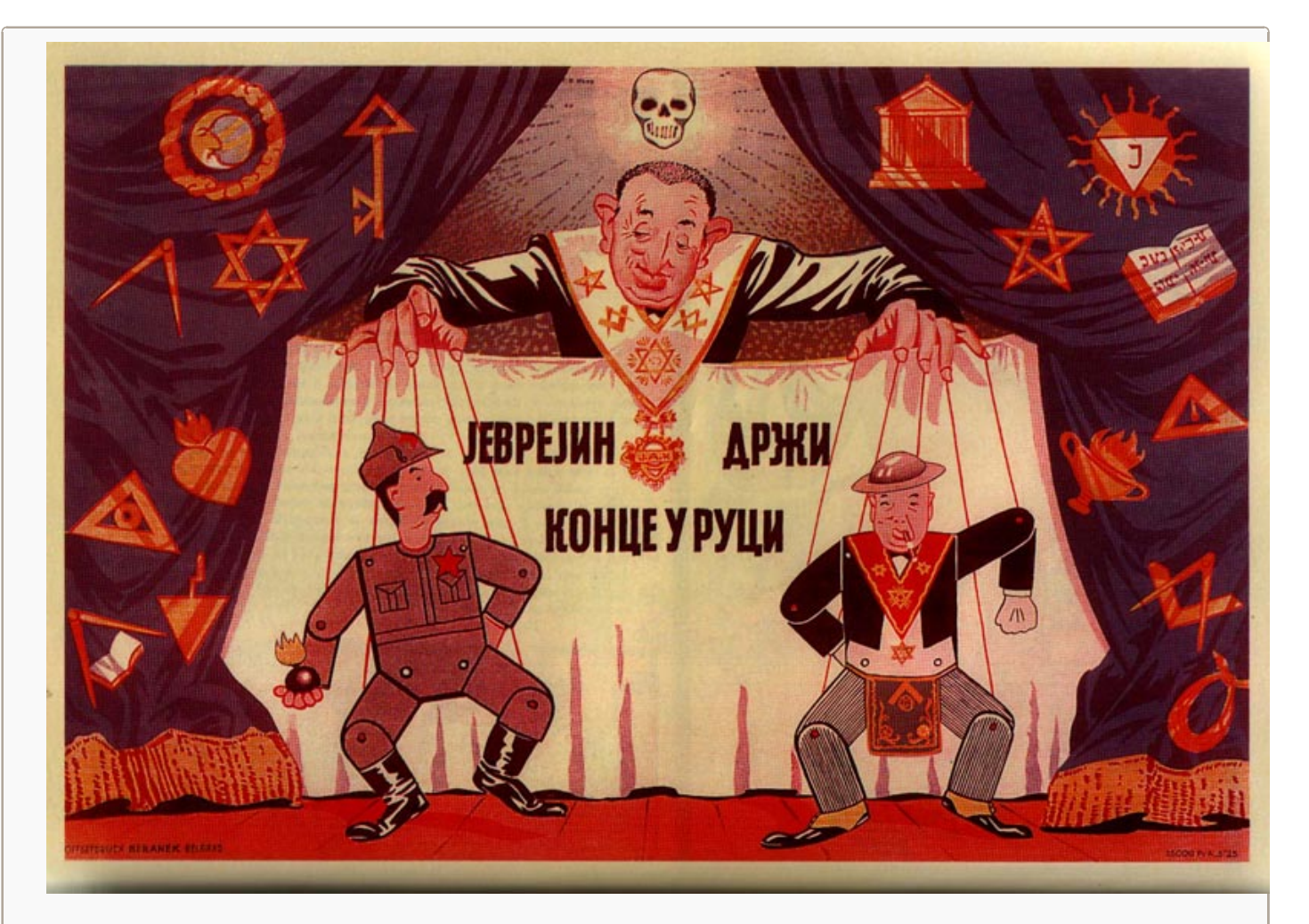
Communism is Jewish, Freemasonry is Jewish — Gentile communists and freemasons are nothing more than the cat's paw of the International Jewish Money Power.