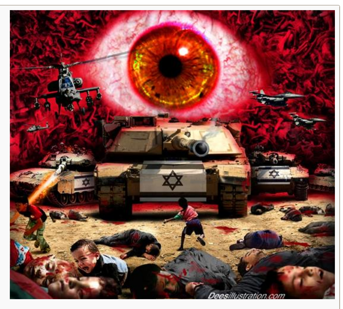
The treacherous terror of Zion permeates the globe!

"And when the LORD thy God shall deliver them before thee: thou shalt smite them, and utterly destroy them: thou shalt make no covenant with them, nor