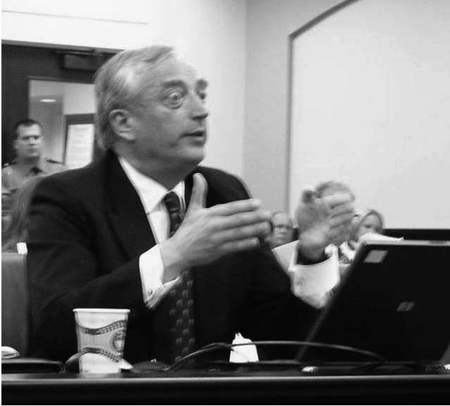
Lord Christopher Monckton