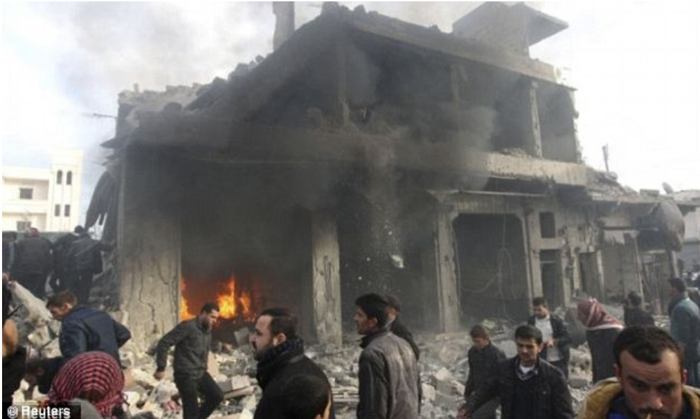
Devastation: People gather at a site hit by what activists said was missiles fired by a Syrian Air Force fighter jet from forces loyal to Assad, at the souk of Azaz, north of Aleppo on January 13

A leaked U.S. government cable revealed that the Syrian army more than likely had used chemical weapons during an attack in the city of Homs in December.