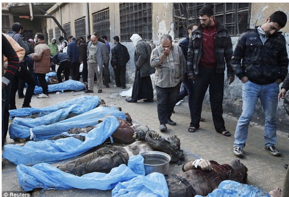
Countless losses: Families attempt to identify the bodies of Syrian fighters shot and dumped in a river in the northern Syrian city of Aleppo today

A spokesman said that the U.S. joined the international community in 'setting common redlines about the consequences of using chemical weapons'.