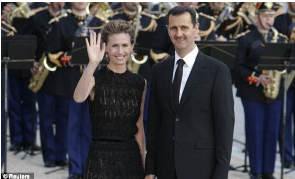
Tyrant: Syrian dictator Bashar al-Assad, pictured with his wife Asma, is facing increasing international pressure over his brutal massacre of his own people

Eye witness accounts from the investigation revealed that a tank launched chemical weapons and caused people exposed to them to suffer nausea, vomiting, abdominal pain, delirium, seizures, and respiratory distress.