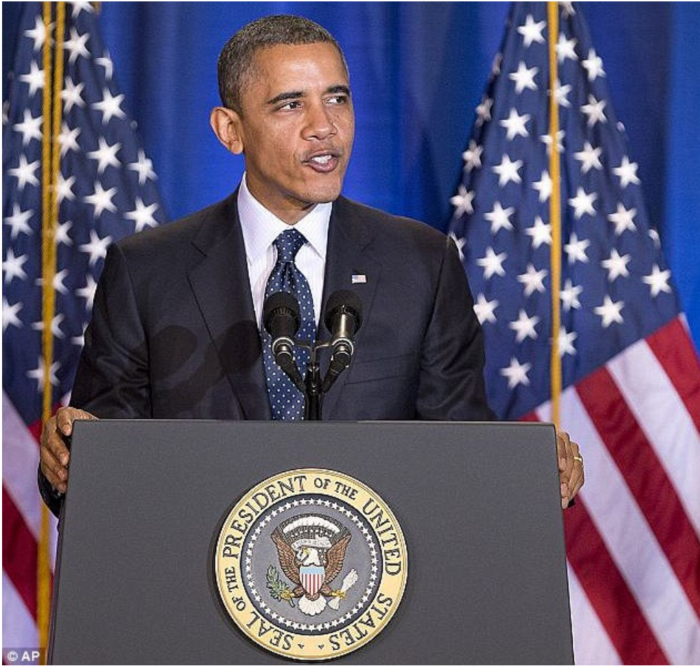
Threats: Barack Obama said during a speech last month that if Syria used chemical weapons against its own people it would be 'totally unacceptable'