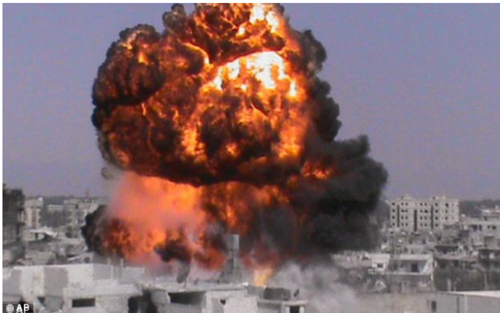
War games: An explosion in the Syrian city of Homs last month. It has been now been suggested that the U.S. backed the use of chemical weapons to spur international military intervention